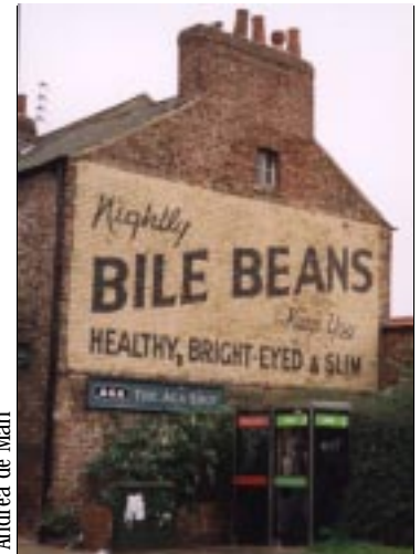
Only in England!

The focus of my trip, however, was an itinerary rich in art, architecture, gardens, history and culture. I purchased a membership in The National Trust, an organization begun in 1895 to protect and maintain national treasures as diverse as ancient stone circles, Roman ruins, medieval castles, and historic homes and gardens. One of the many benefits of the membership is free admittance to literally hundreds of sites throughout Great Britain. For example, it was such a pleasure to walk the paths of gardens designed by Lancelot "Capability" Brown at Petworth House, south of London. Brown was an 18th-century landscape planner who extolled the beauty of the natural landscape. Osterly Park, nearby, was a crumbling Tudor mansion in 1761 when Robert Adam was hired to transform it into a neoclassical country villa. Some of Adam's most exquisite work is found here in his richly carved plaster work and straight-lined furniture. Waddeston Manor in Buckinghamshire was the home of Baron Ferdinand de Rothschild and was built in the 1870s. The house is